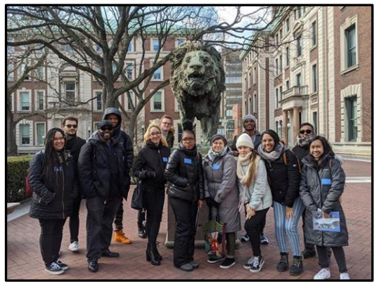
Columbia University, March 2020