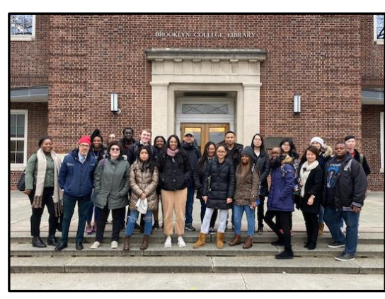
Brooklyn College, March 2020